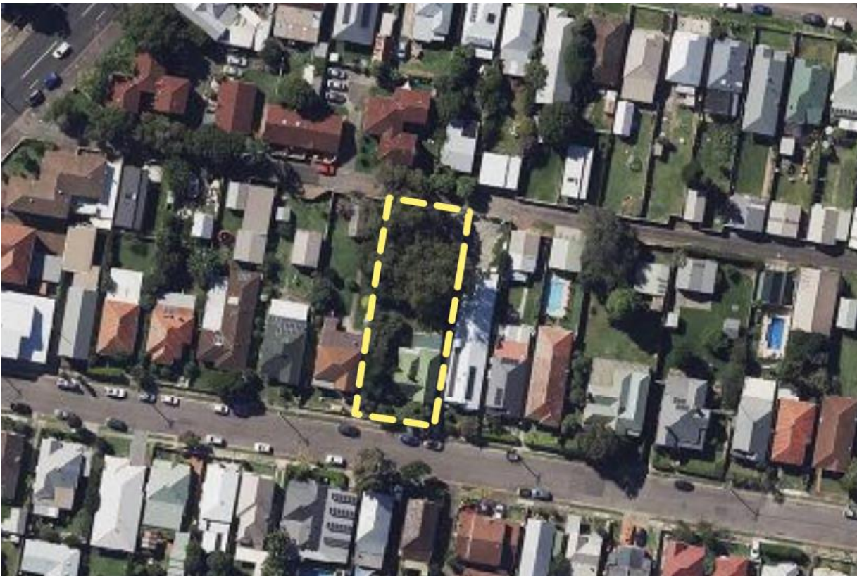
Figure 2: Aerial imagery of the site