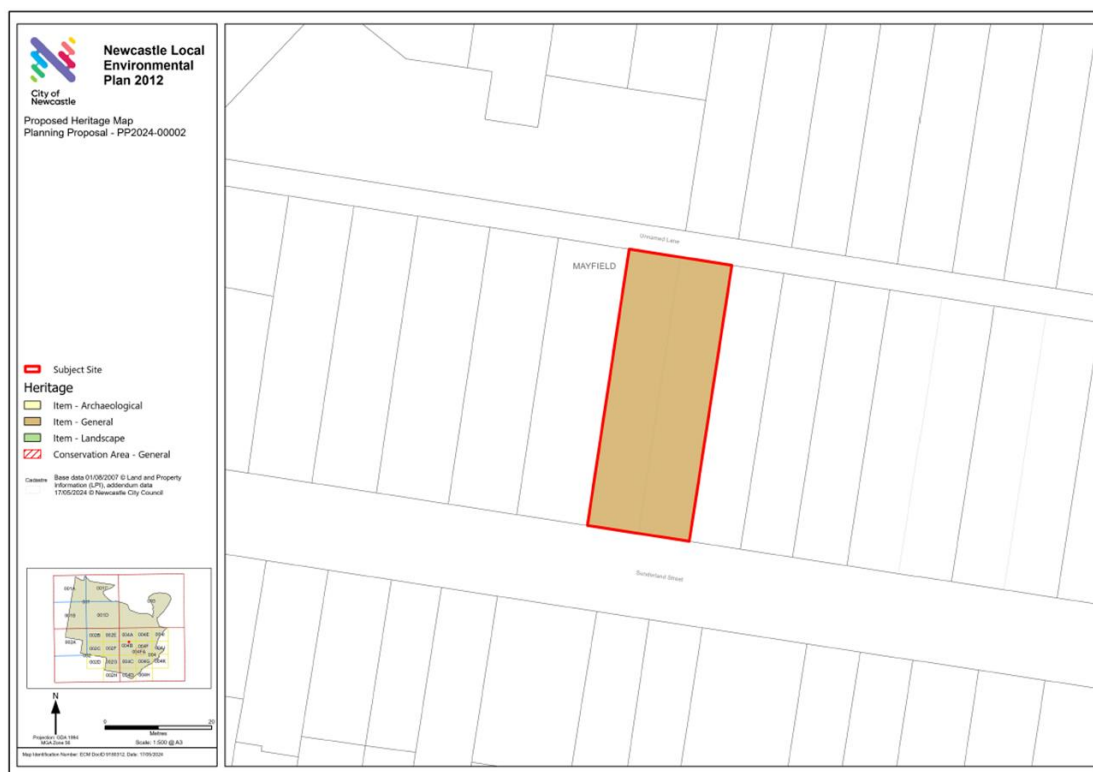
Figure 4: Proposed Newcastle LEP 2012 Heritage map (planning proposal 2024)